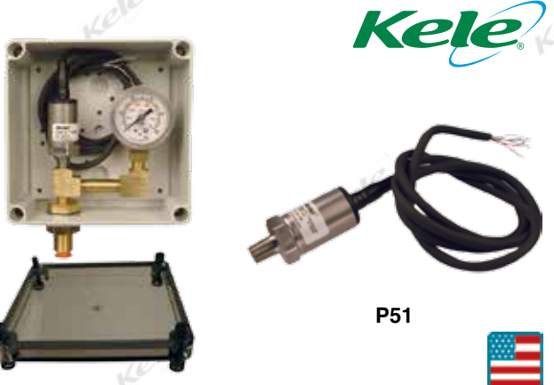
P51 with optional enclosure and gauge